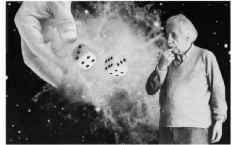
Philosophy & Ethics asks the questions other subjects don't dare!